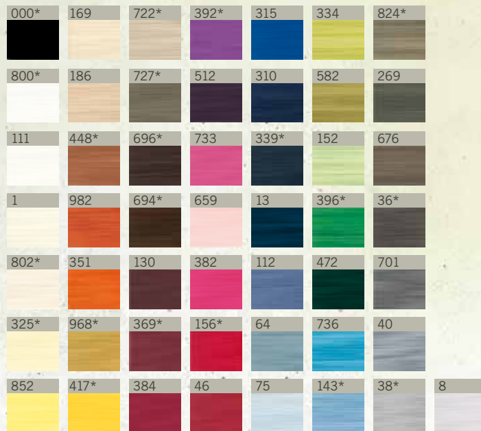
Small shade variations may occur